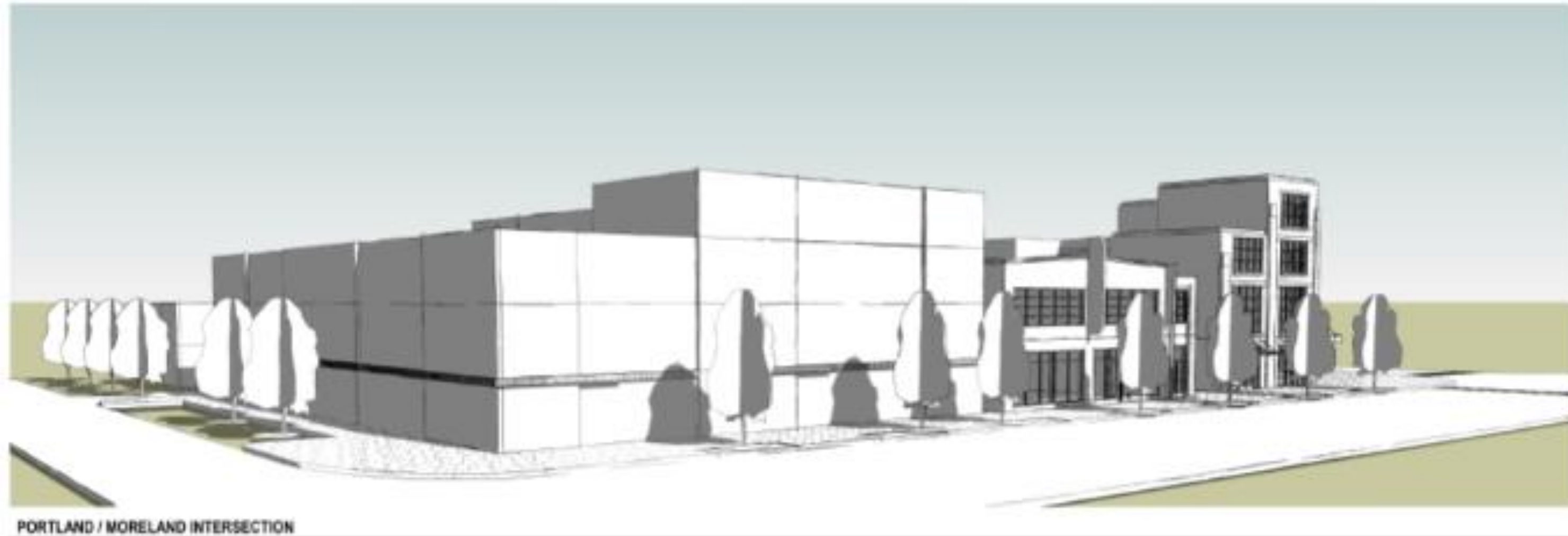
PORTLAND / MORELAND INTERSECTION