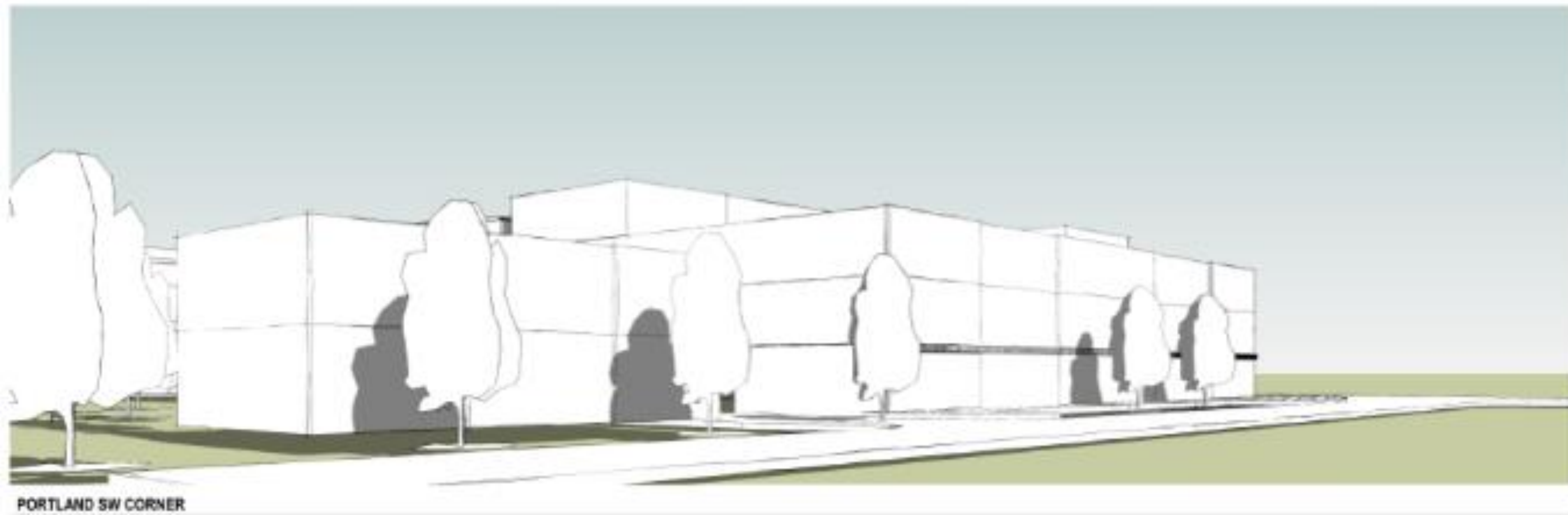
PORTLAND SW CORNER