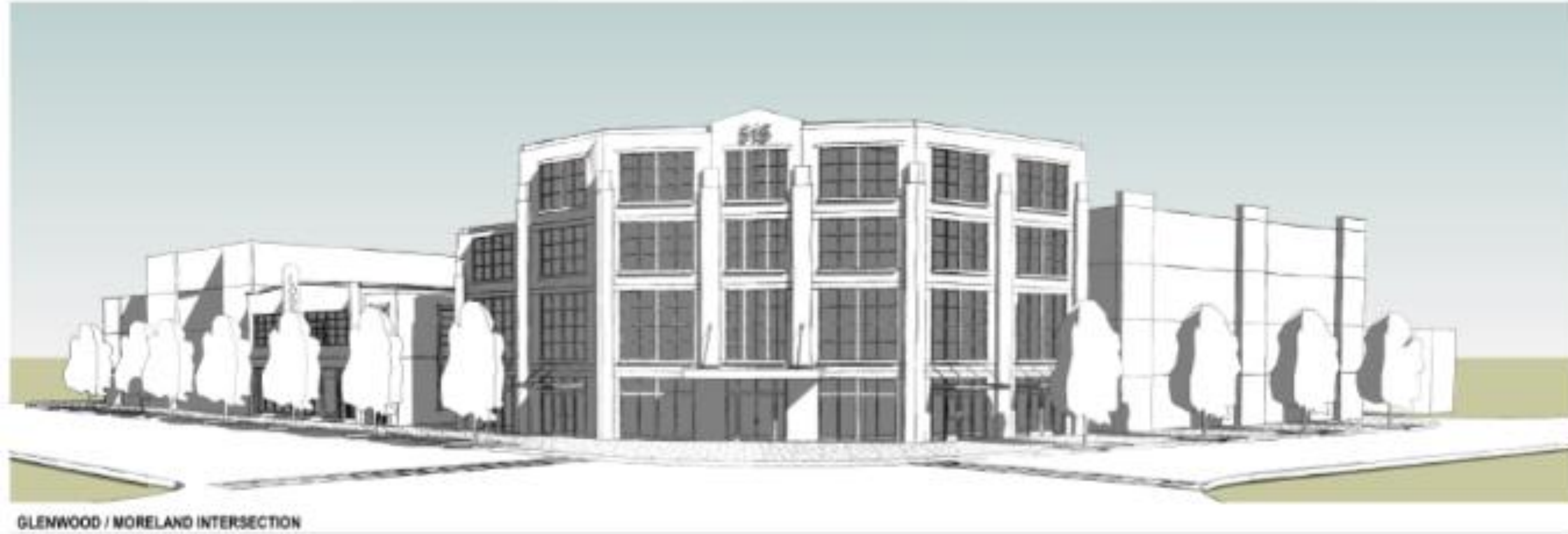
GLENWOOD / MORELAND INTERSECTION